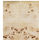
MAPPA BURL, PURE