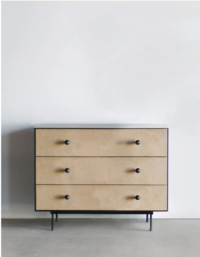
// SHOWN IN 3 DRAWERS

LEATHER + INDUSTRIAL STEEL + POLY FINISH POWDER COAT FINISH