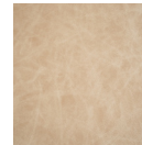
SALOON FRENCH VANILLA